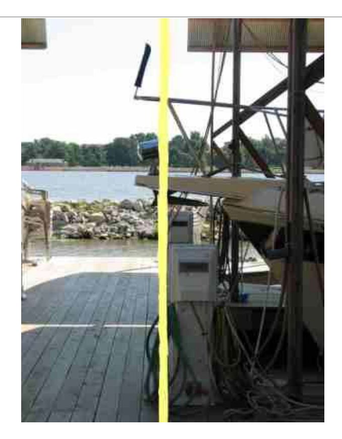
This picture represents the manor in which the vessel over hang is measured for a Bow & Stanchion Over Hang ** NOT In Compliance **