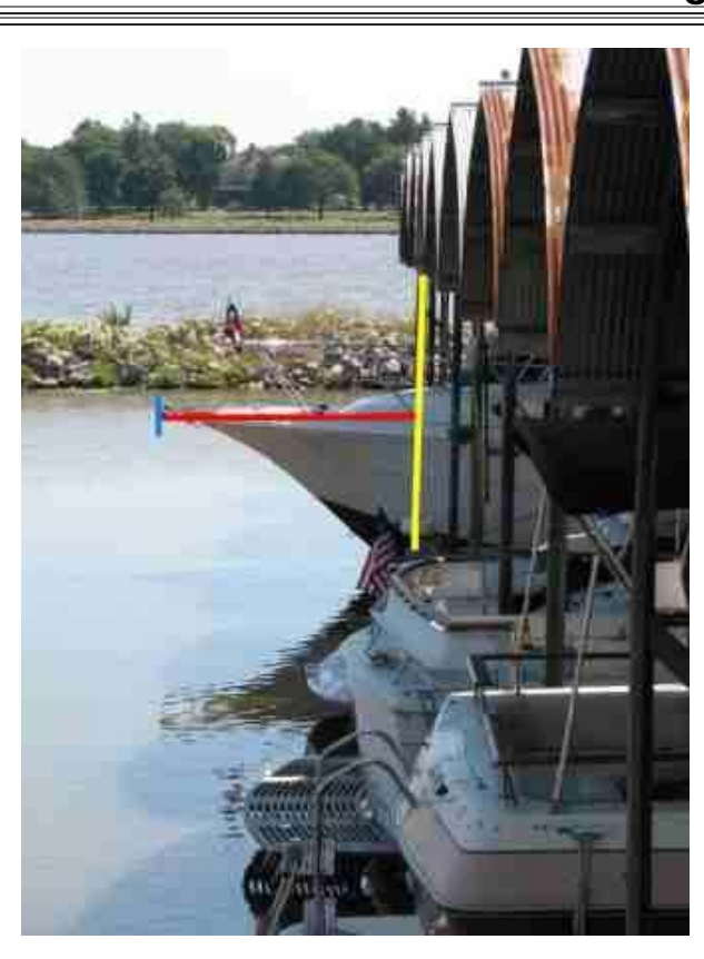
This picture represents the manor in which the vessel over hang is measured for a Stern In Bow Over Hang.