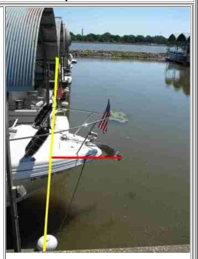
This picture represents the manor in which the vessel over hang is measured for a Stern In Bow Over Hang.